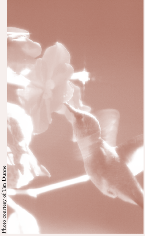
Ruby-throated Hummingbird, a summer species in the Algonquin-Lake Nipissing ecoregion.